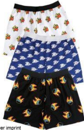
all over imprint